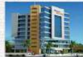
Ambition tower, Jaipur