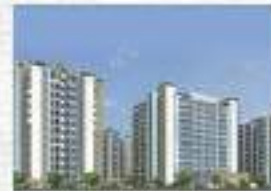
Rangoli greens, Jaipur