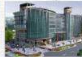
Fun square, Udaipur