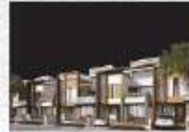
Casa Amora, Goe