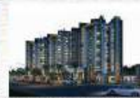
The grand residency, Jaipur