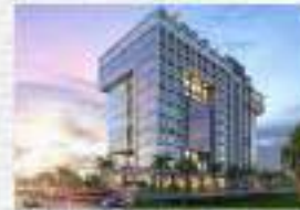
Signature tower, Jaipur