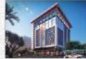
Signature elite, Jaipur