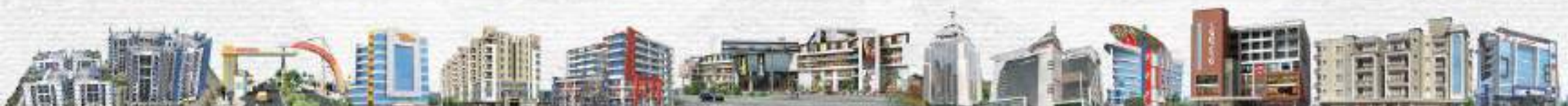
Townships | Hotels | Amusement | Park | Finance | Infrastructure | Shopping | Malls | Corporate | Offices | Residential | Apartments