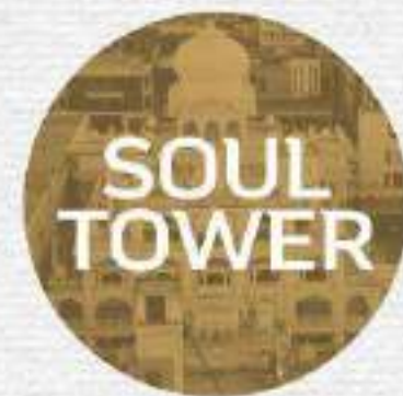
Typical Floor Plan Soul Tower