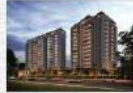
Woodland Park, Jaipur