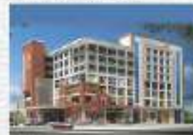
Geelgah tower, Jaipur